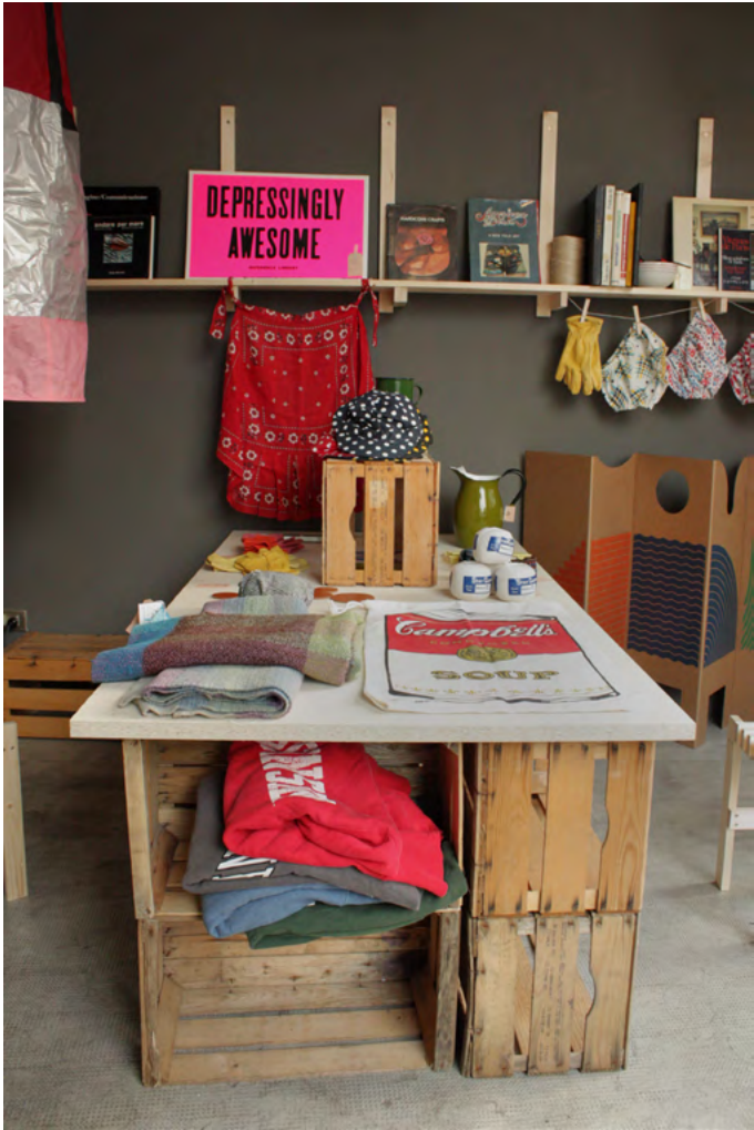
Vintage Americana: useful objects, college sweatshirts, and day-glo posters.