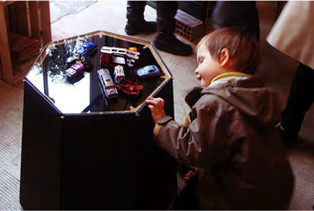
Rich, Brilliant, Willing's collection of side tables was a hit.