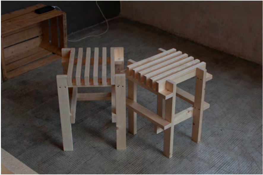
Max Lamb designed and built the shop's fixtures.