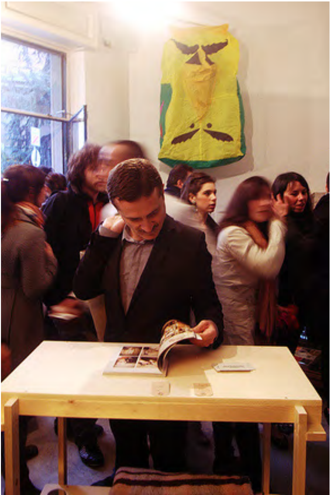
Opening party also launched Apartamento issue 03.