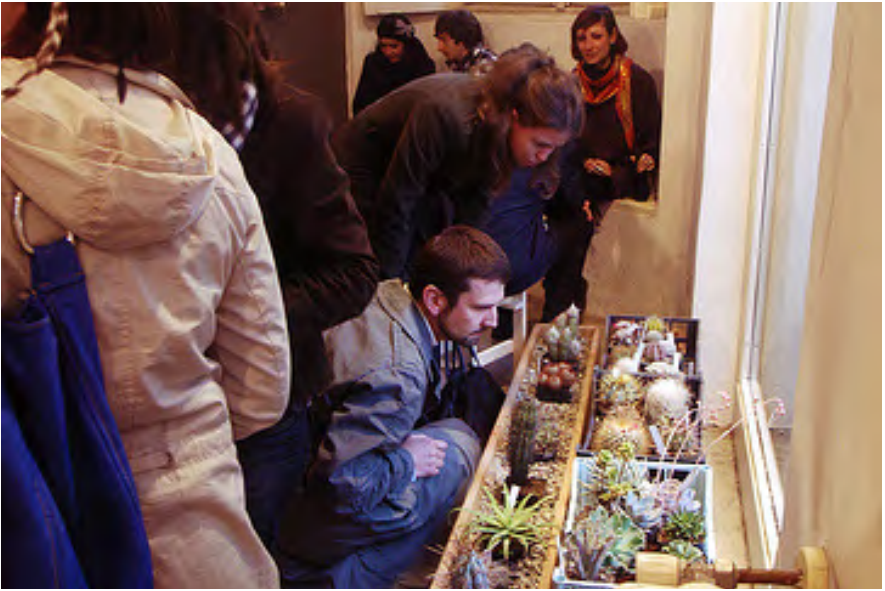
An assortment of beautiful funky cacti and succulents.