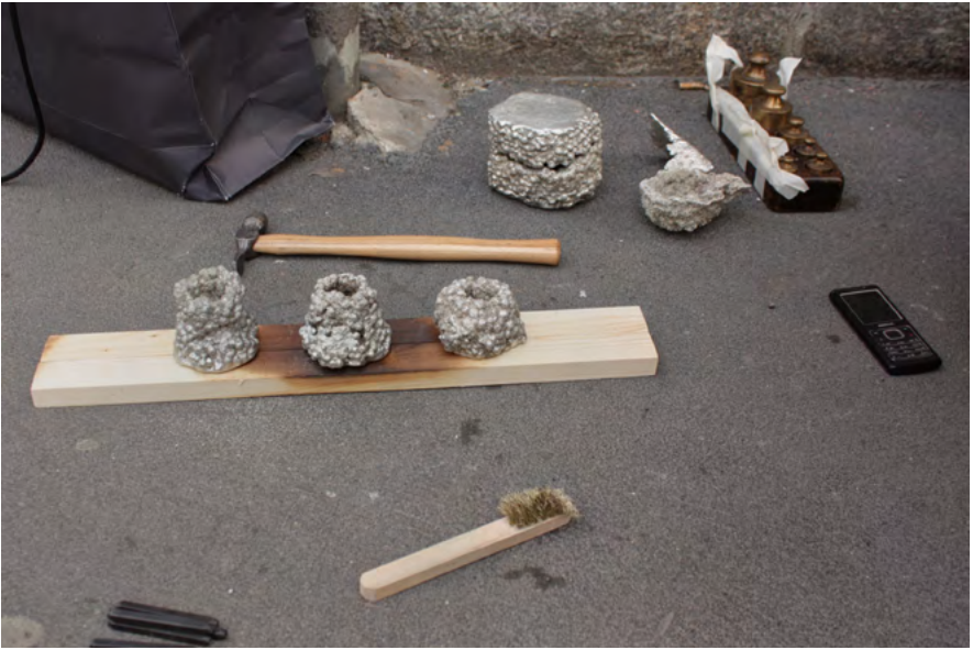
Max Lamb cast pewter objects on the sidewalk.